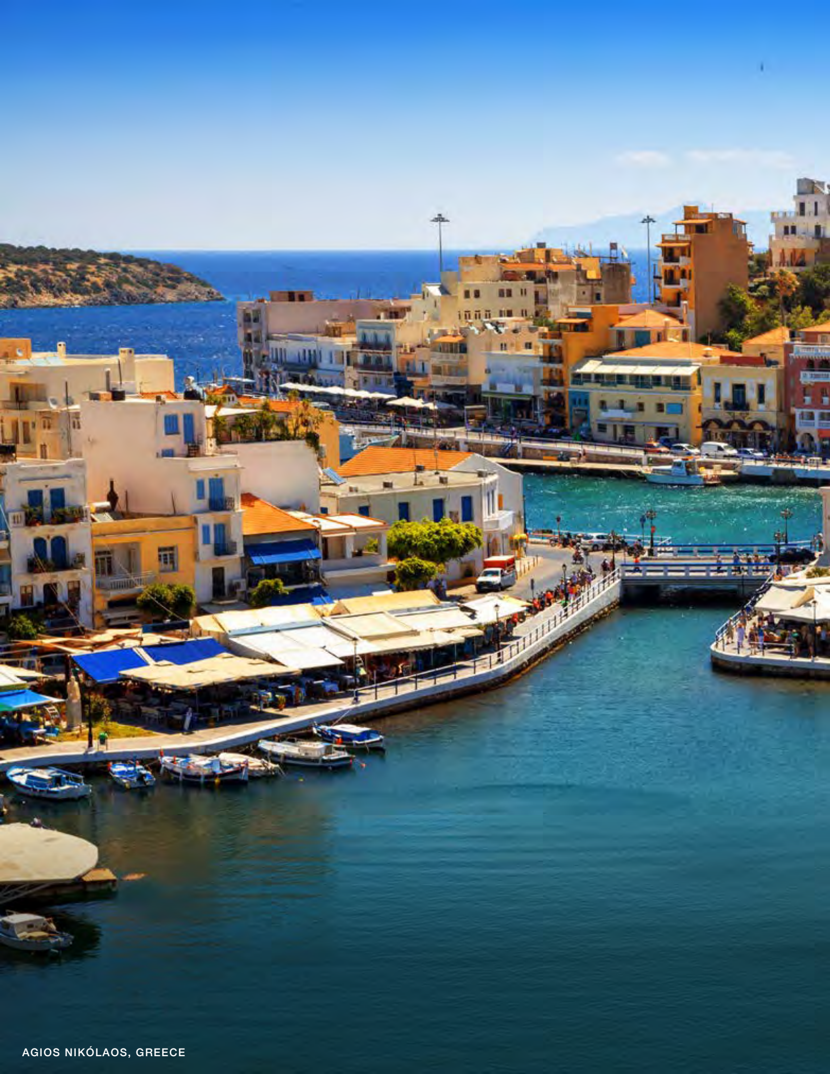
AGIOS NIKÓLAOS, GREECE