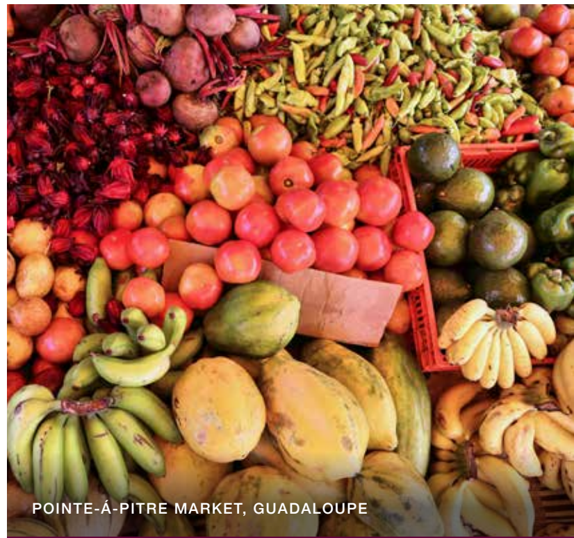
POINTE-À-PITRE MARKET, GUADELOUPE