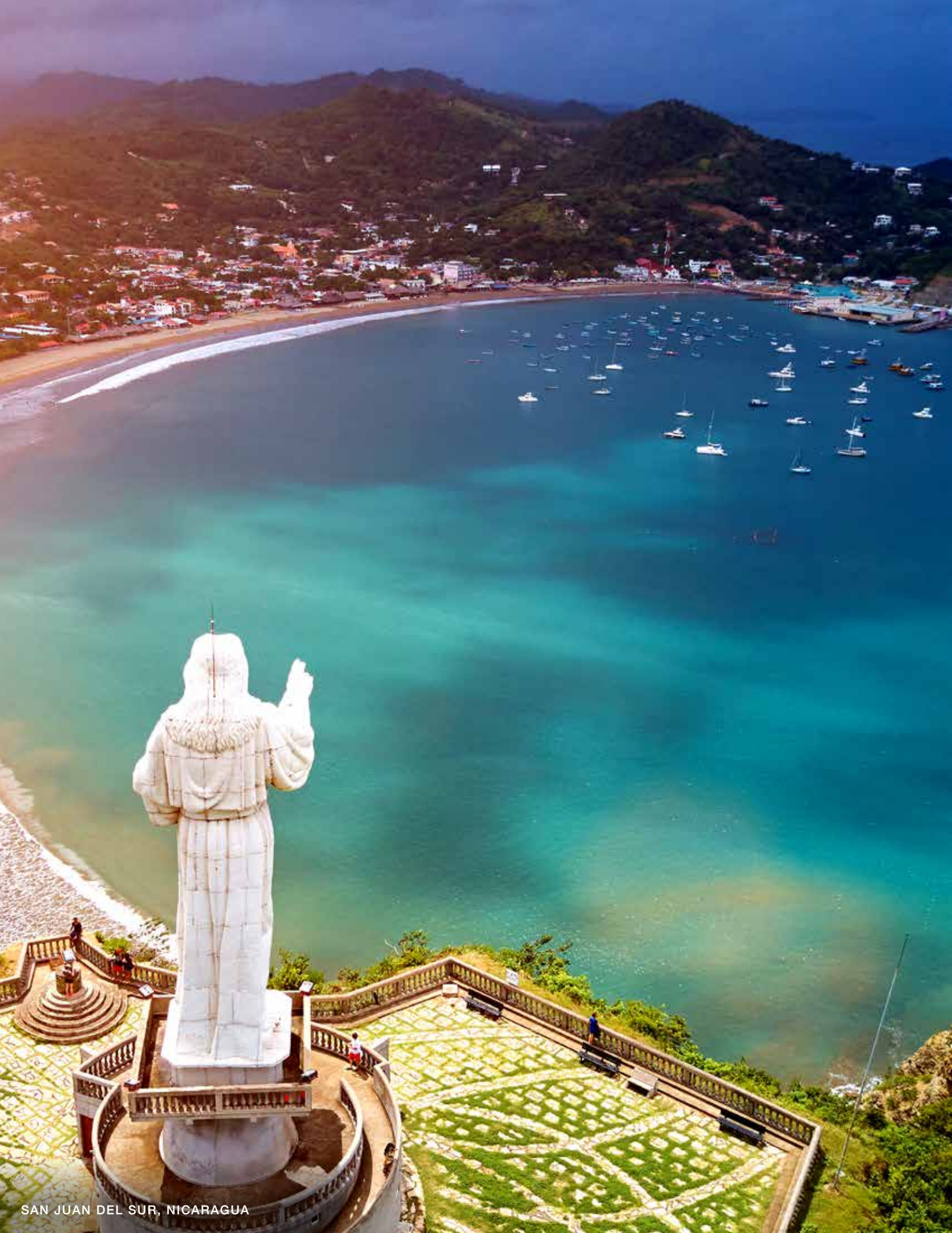
SAN JUAN DEL SUR, NICARAGUA