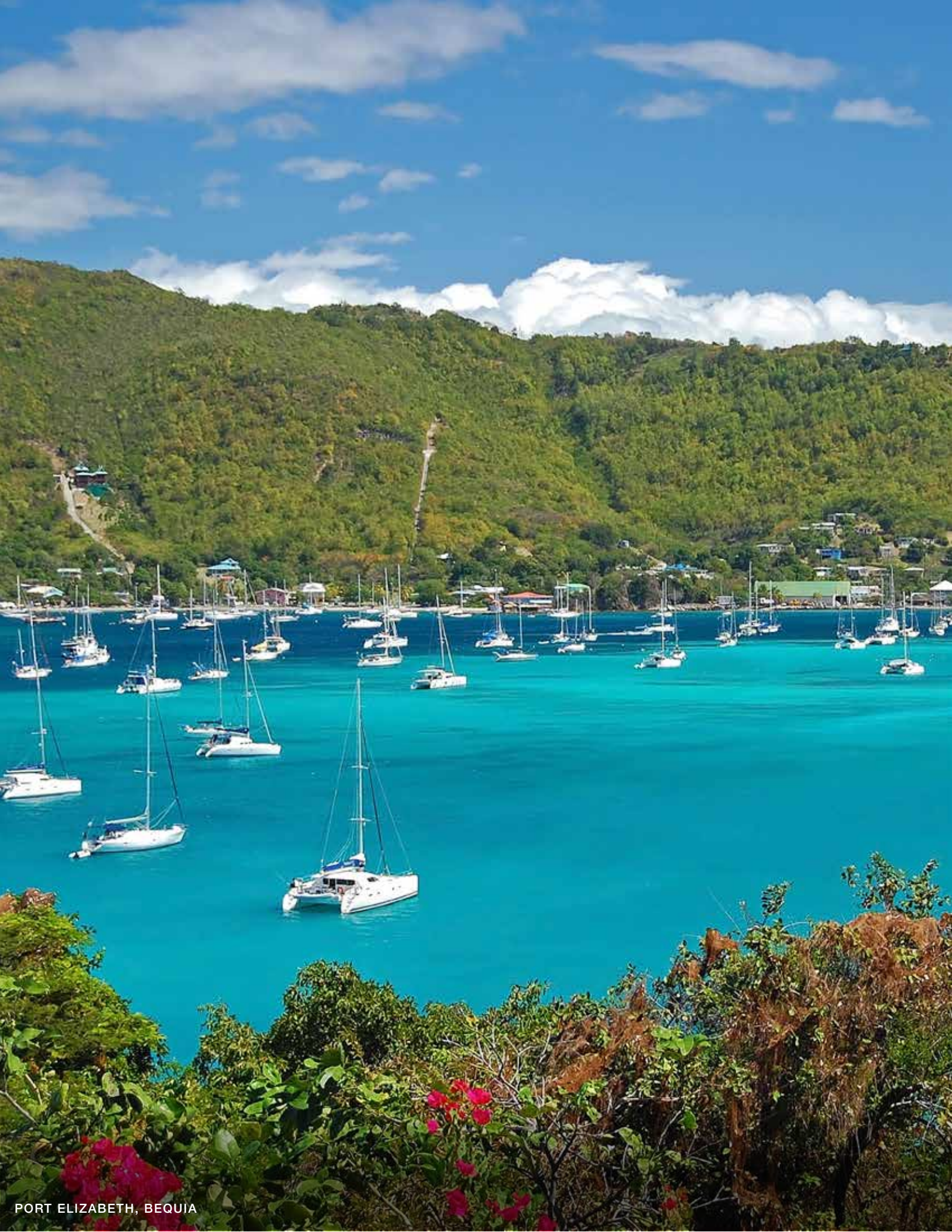
PORT ELIZABETH, BEQUIA