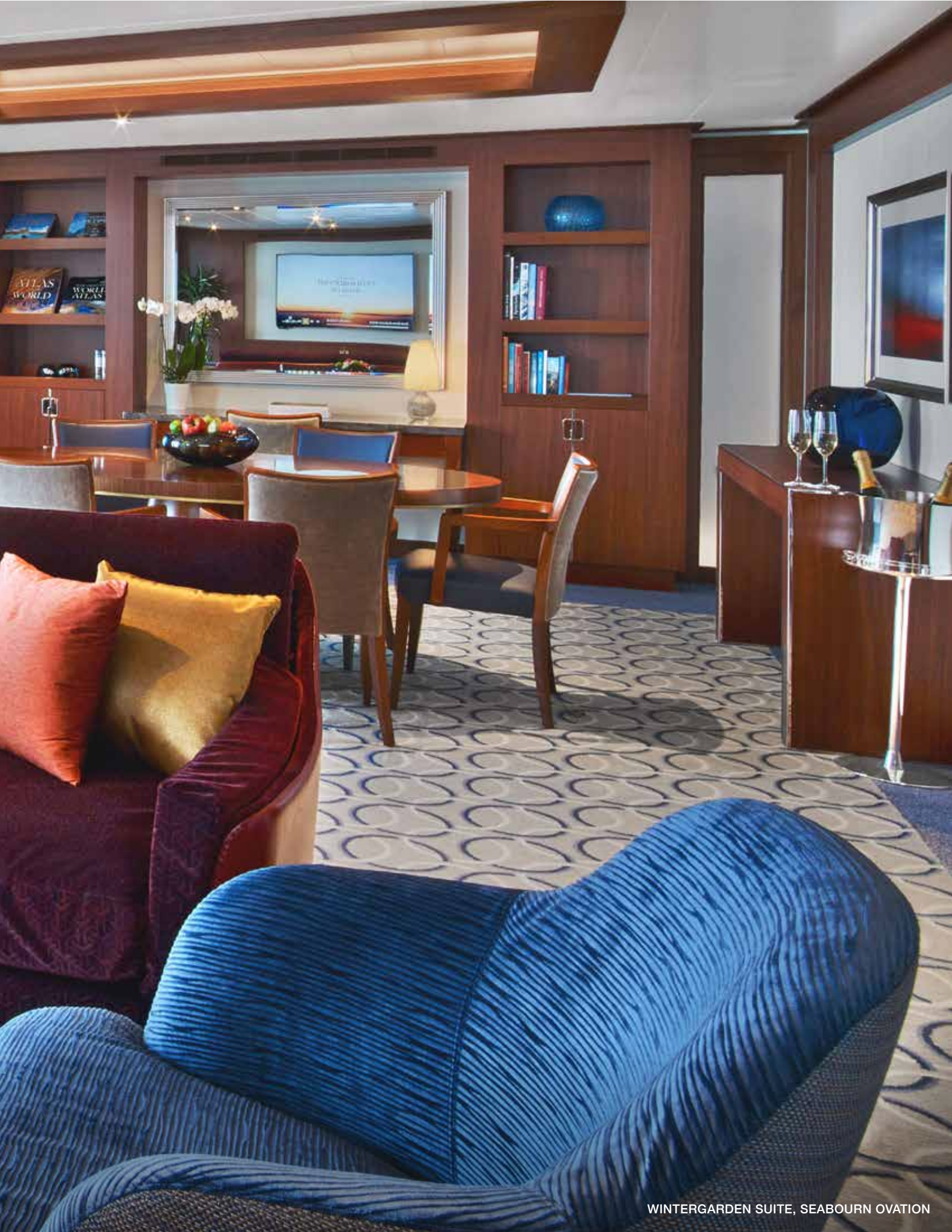
WINTERGARDEN SUITE, SEABOURN OVATION