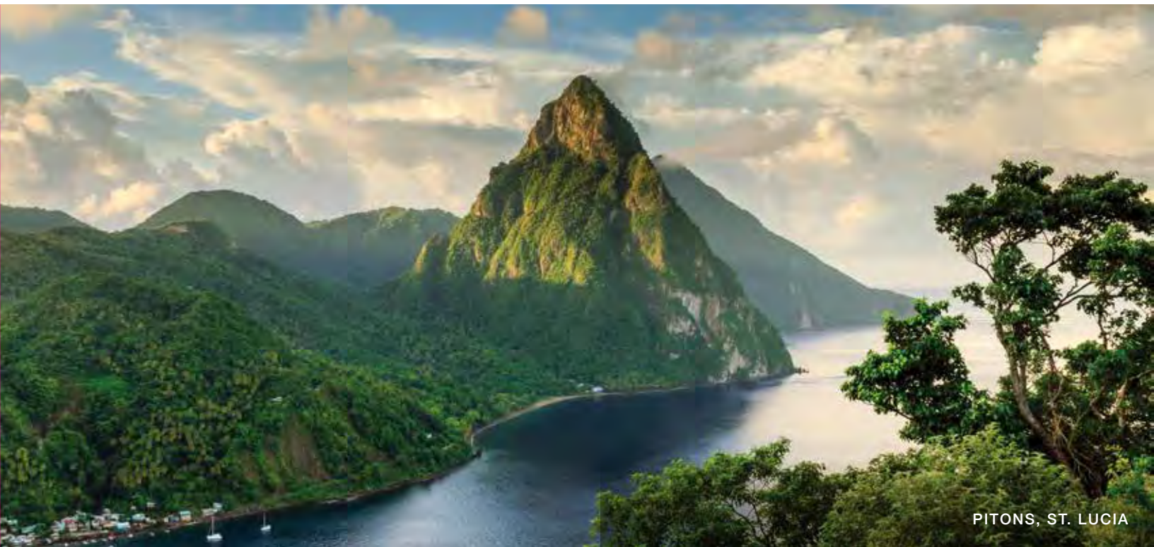
PITONS, ST. LUCIA