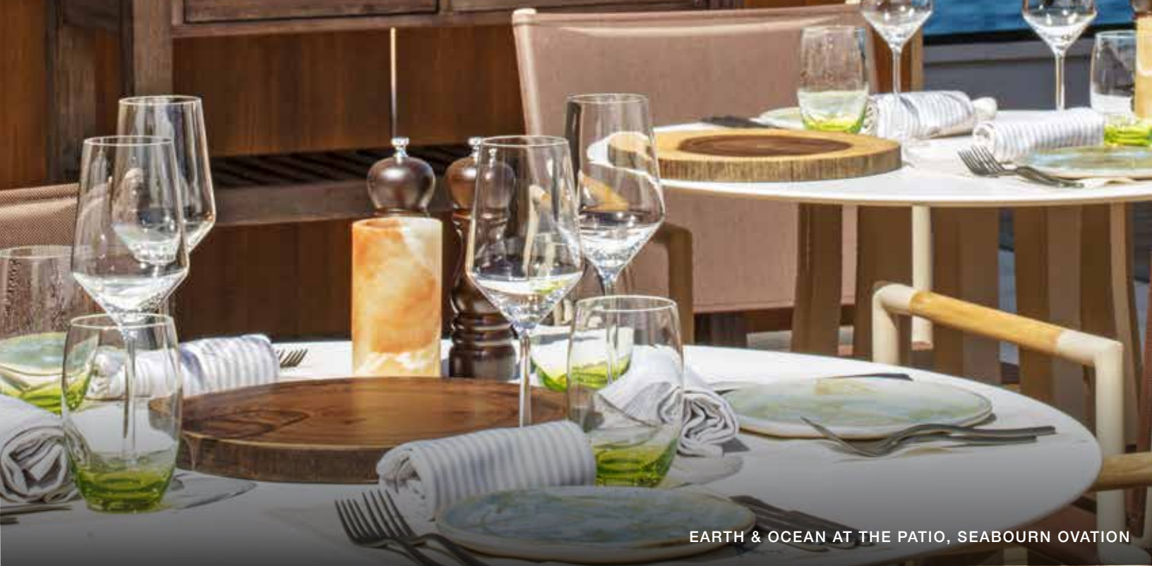
EARTH & OCEAN AT THE PATIO, SEABOURN OVATION