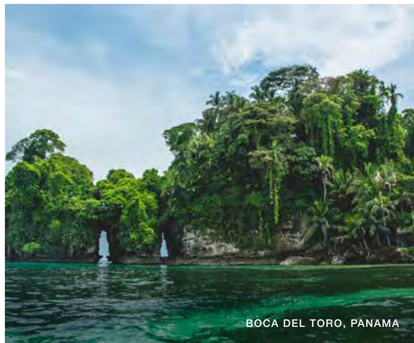
BOCA DEL TORO, PANAMA