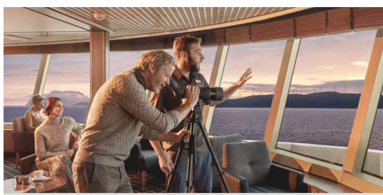
Tor's Observation Lounge, Silver Cloud