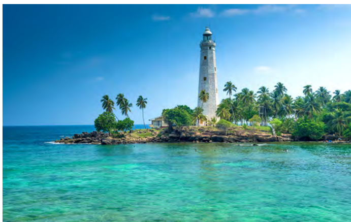
Dondra Cape surrounded by palm garden, Sri Lanka

*Available from selected gateways/countries. Non-use air credit available for other countries. **For USA, Canada, UK, Germany, Australia only.